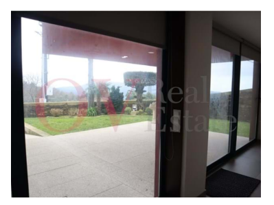
= 2 Bedrooms