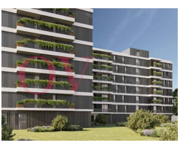
!= 1 Bedrooms